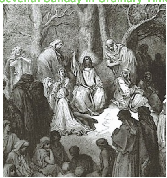
Love Your Enemies